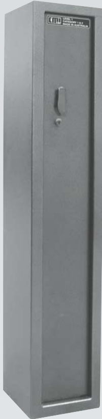
MODEL SDS-1 HOLDS 1 TO 4 GUNS