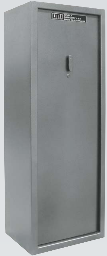
MODEL SDS-3 HOLDS 1 TO 8 GUNS