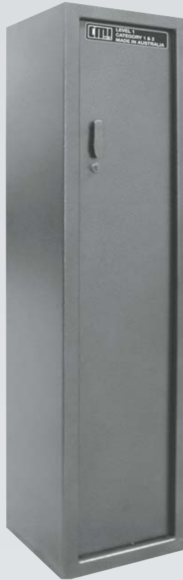
MODEL SDS-2 HOLDS 1 TO 6 GUNS