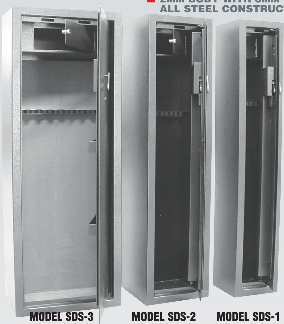
MODEL SDS-3 HOLDS 1 TO 8 GUNS